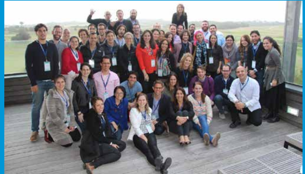
Participants at LaunchPad's three-day retreat at Peppers Moonah Links Resort.

The AJF in partnership with the ROI Community and JCA (NSW) created LaunchPad - a platform for Jewish community innovation in Australia.